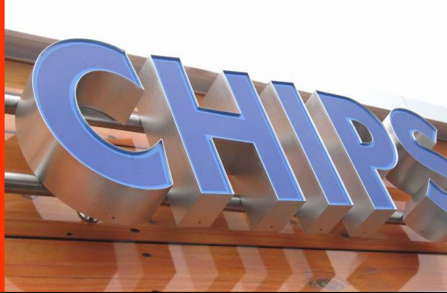
Chips Ahoy, Portadown

☛ these letters create an elegant strong branding that has been previously reserved for large franchises, but are now cost effective for an independent retailer.