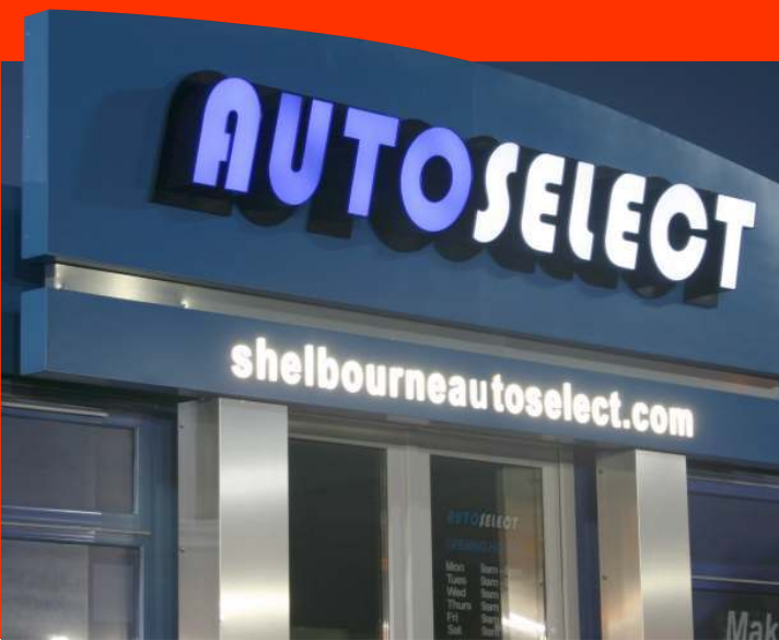
AutoSelect - Shelbourne Motors Portadown