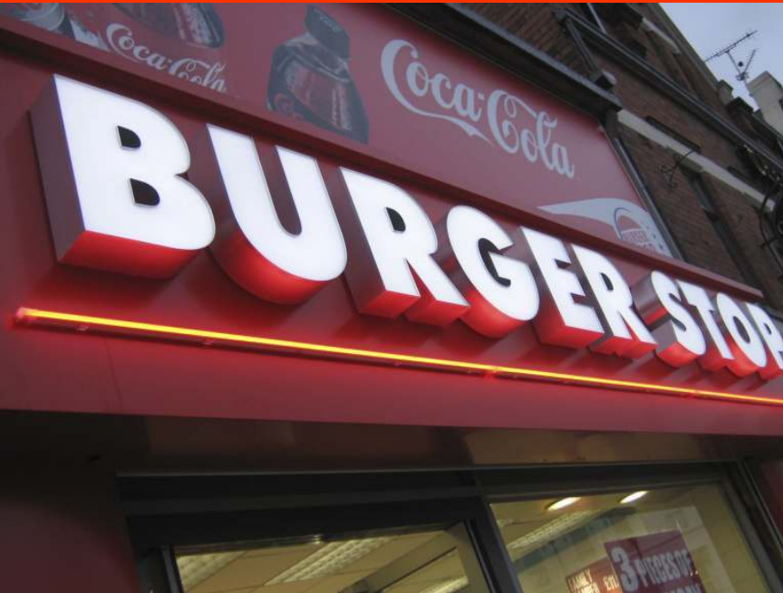
Burger Stop Lurgan