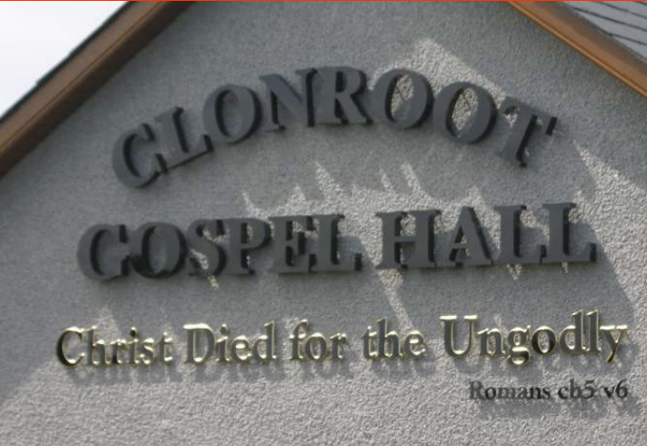
Clonroot Gospel Hall - 3d built up letters

built up stainless steel letters add an impressive touch to your building. they can be illuminated with coloured leds. letters are set out from wall on stainless steel spacers and chemically fixed to brick or block work. verses can be added below, made from 5mm black acrylic with a gilded gold leaf bevelled edge.