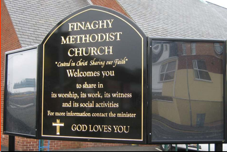
Finaghy Methodist Church - V carved panel & poster cases

bespoke signage can be designed to suit your needs. special shaped panels can then be created and extras such as poster cases can be incorporated into your signage.