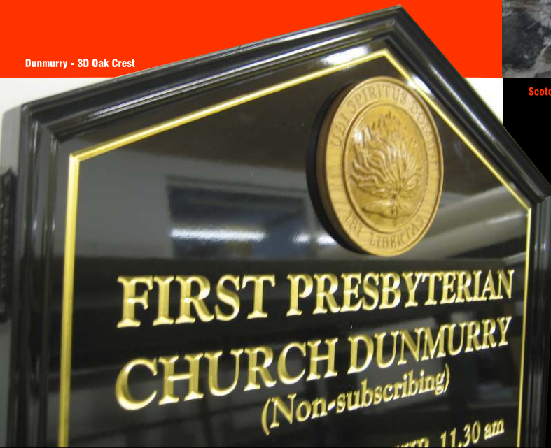
Dunmurry - 3D Oak Crest