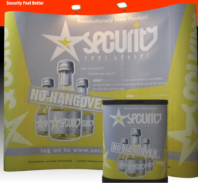
Security Feel Better