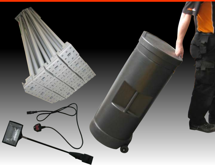
Curved pop up exhibition - folded down to fit into storage box