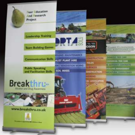
Selection of banner pull ups