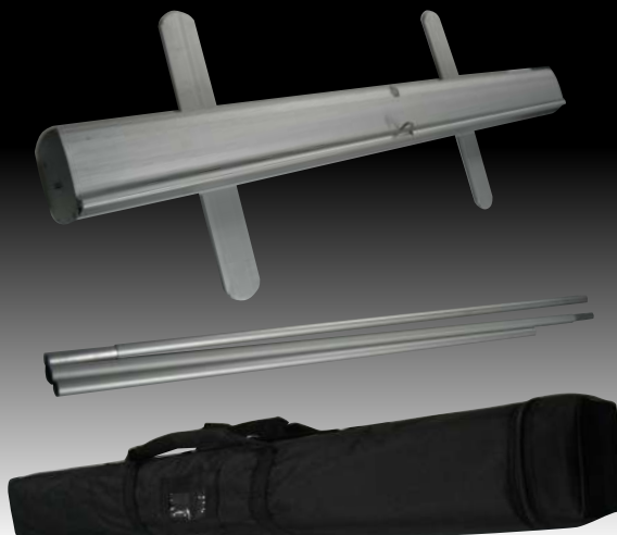
Pull up display - rolled down to fit into carry bag

www.sunsetsigns.co.uk design print create