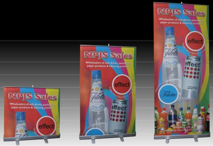
Banner pull up - as easy as 1 2 3

the spring loaded banner pull up unit allows the graphic[s] to be conveniently rolled away when not in use to save space and to protect the graphic[s].