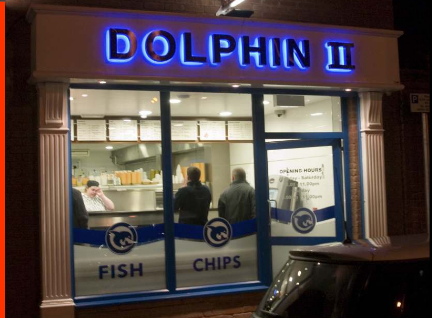
Dolphin II with blue led illumination - Armagh