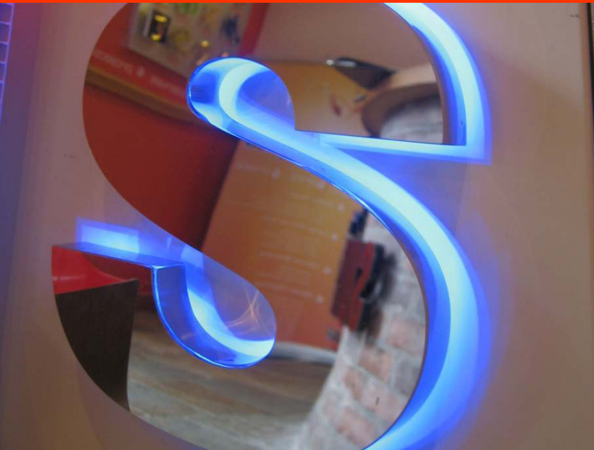
Polished stainless steel letter - halo illuminated with blue leds