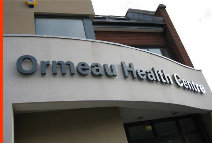
Ormeau Health Centre - Belfast

☛ please visit our showroom for wide choice of samples