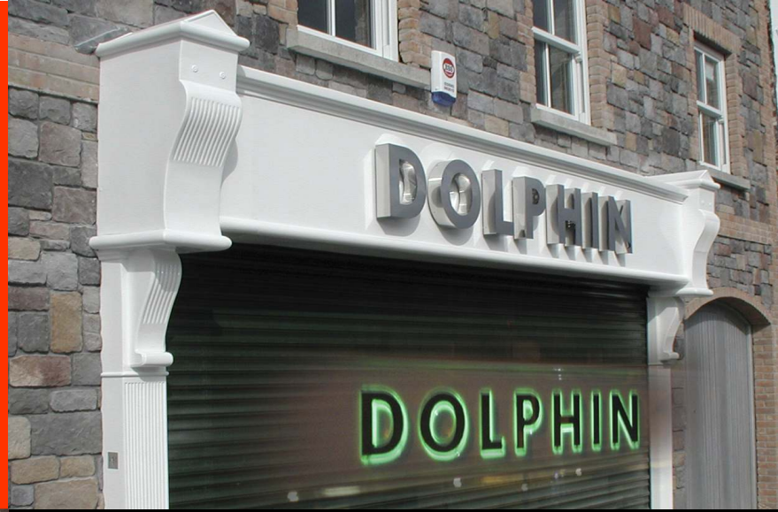
Dolphin Take Away with green led illumination - Dungannon

where cost is a concern we also provide a mock stainless steel letter either flat cut 3mm thick aluminium composite with polished face, or the same letter can be mounted on a 19mm thick pvc letter to create depth. if illumination is required it can be hollowed out from the back to accommodate led halo illumination.