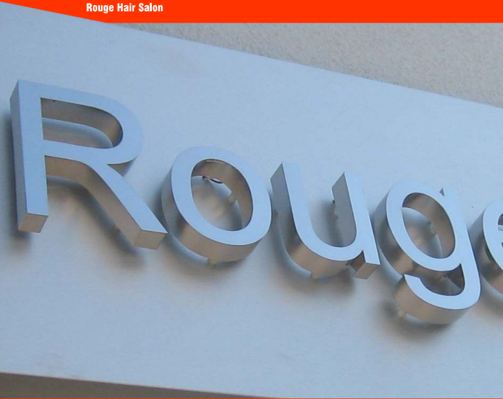
Rouge Hair Salon

fabricated sign panel in brushed stainless steel and polished stainless steel letters with 50mm return, illuminates red using leds