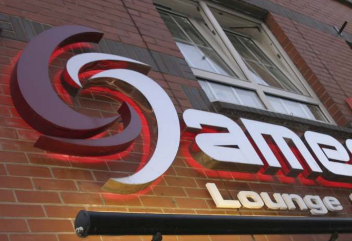
Jameson's lounge & sports bar with red led illumination - Portadown

polished stainless steel letters halo illuminated red to create atmosphere using energy efficient 12 volt leds