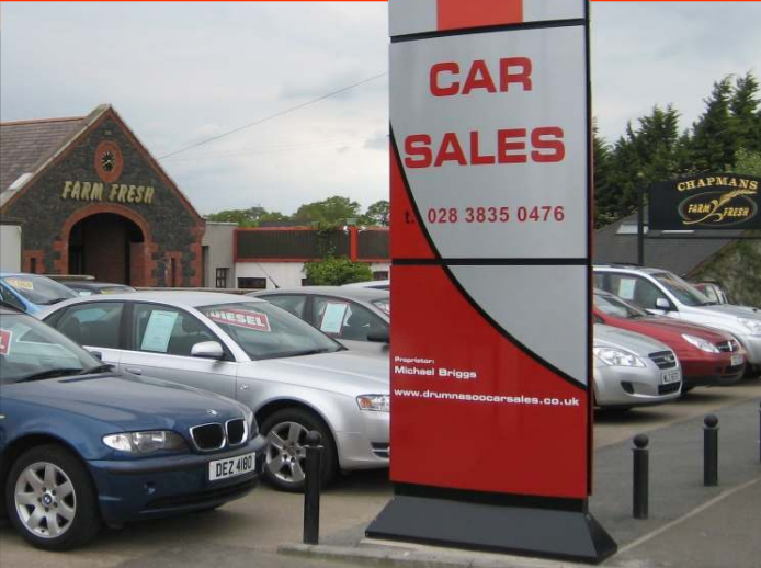
Drumnasoo Car Sales - modular