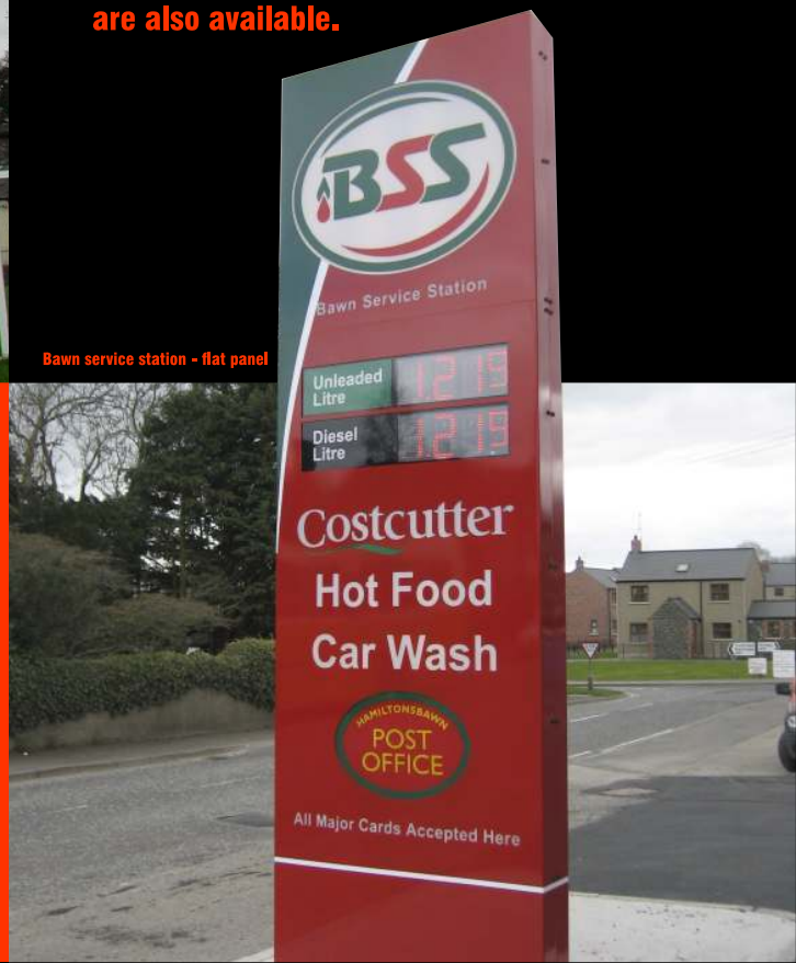
Bawn service station - flat panel