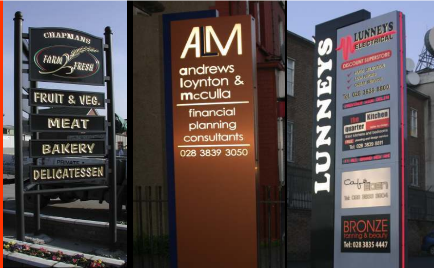
Farm Fresh - traditional

● manufactured with steel frames, folded trims, aluminium, dibond, perspex or flexi-face sign faces.