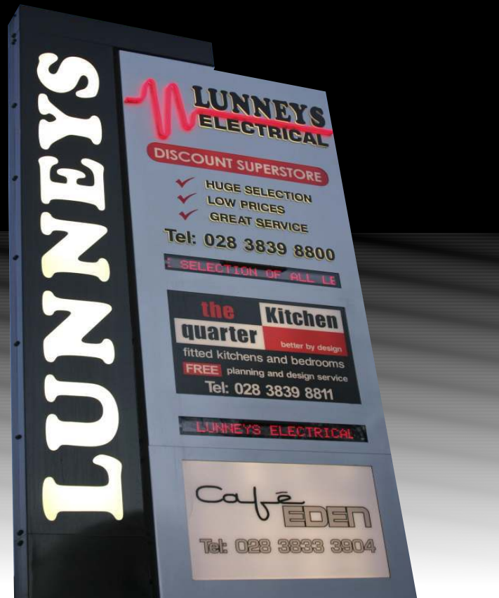
Lunneys Electrical - customised flat panel totem

● high quality finish in a range of colours including any ral or pantone colour, satin or gloss