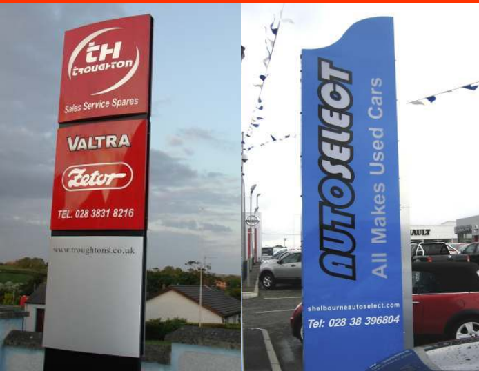
Autoselect - flat panel