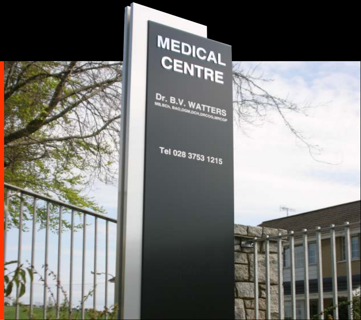
Keady Medical Centre - flat panel

☛ a quality totem design adds that 'high class feel' to any business. totem style signs have become part of the contemporary signage landscape. they can be used in forecourts, shopping centres, hospitals & business parks. if your business is set back from the road then a totem is ideal at drawing attention to it.